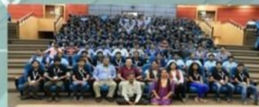
e-Yantra Robotics Competition Finalists @ IIT Bombay