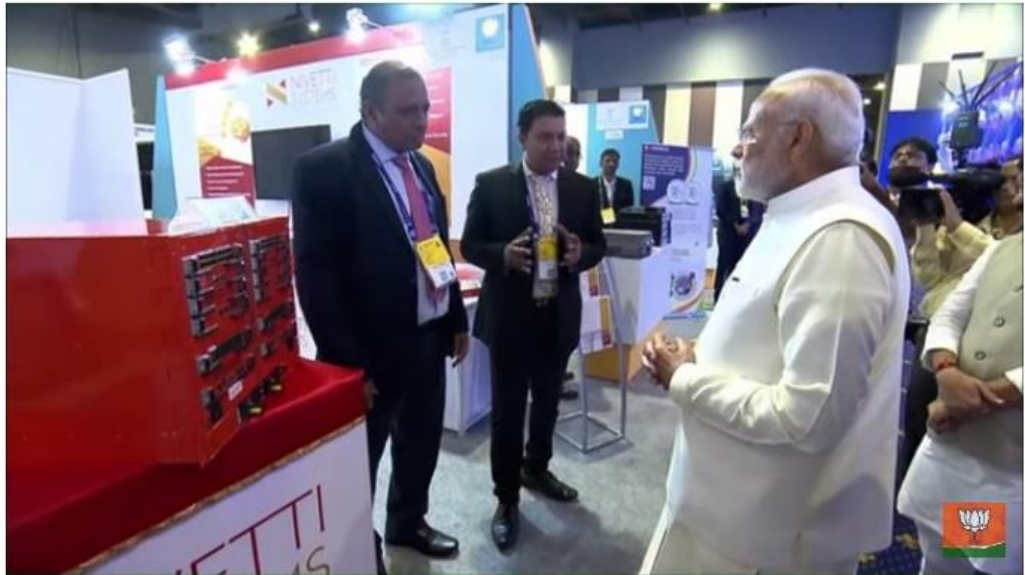
PM Modi launches 5G services and inaugurates 6th edition of India Mobile Congress in New Delhi