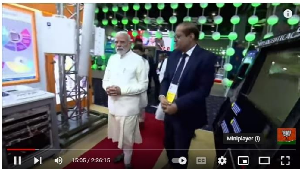
PM Modi launches 5G services and inaugurates 6th edition of India Mobile Congress in New Delhi