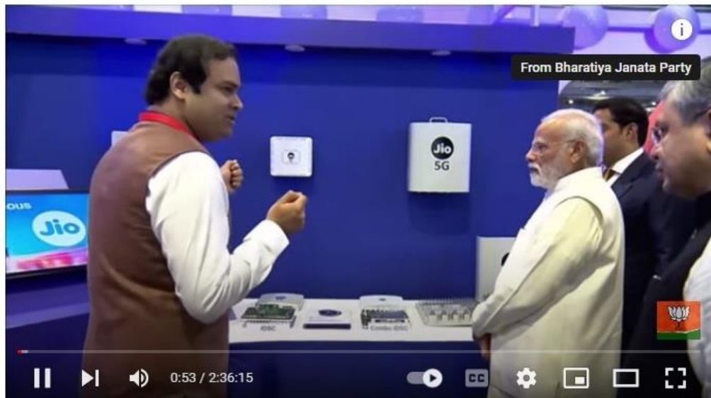
PM Modi launches 5G services and inaugurates 6th edition of India Mobile Congress in New Delhi