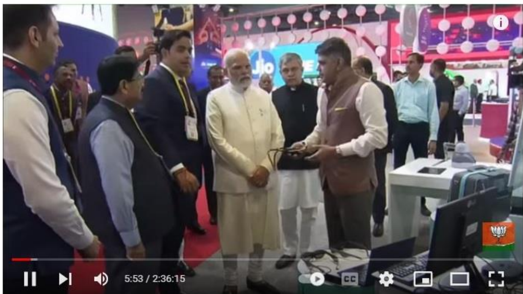
PM Modi launches 5G services and inaugurates 6th edition of India Mobile Congress in New Delhi